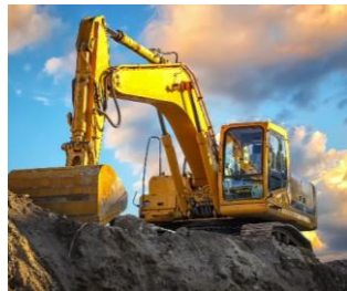
Construction & Mining